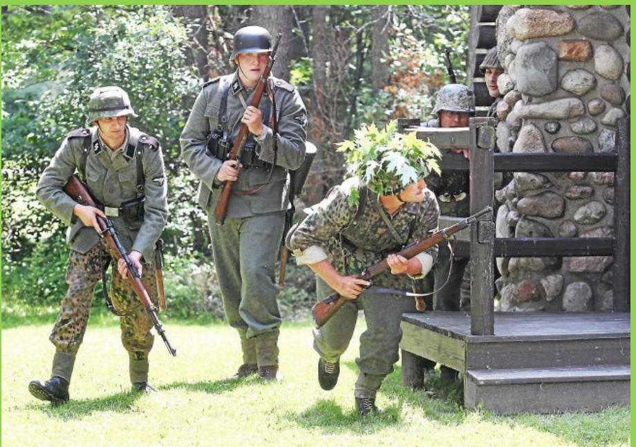
The log cabin under siege!

World War II Re-Enactment (July 14-15, 2018. Saturday 10:00 a.m.-4:00 p.m., Sunday 10:00-3:00) The society will host the Michigan Military Technical Society in a World War II re-enactment of Operation Cobra which was the code-name for an offensive launched by the United States Army, 7 weeks after the D-Day landing during the Normandy Campaign (Operation Overlord), of World War II. It started July 25, 1944 and ended July 31, 1944. The event will feature both an Allied & Axis encampment for public displays with two public battles (11 a.m. and 2 p.m.) on Saturday and one (1 p.m.) on Sunday. Military vehicles will be on display and various vendors will be onsite. Children's activities are provided. Food and drink will be available for purchase. Entrance fee is a donation of $1.00 per person or $2.00 for a family.