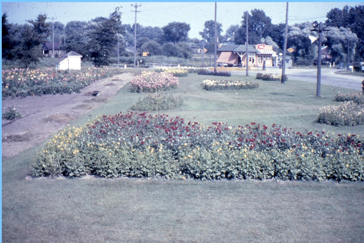
Lakeside Gardens