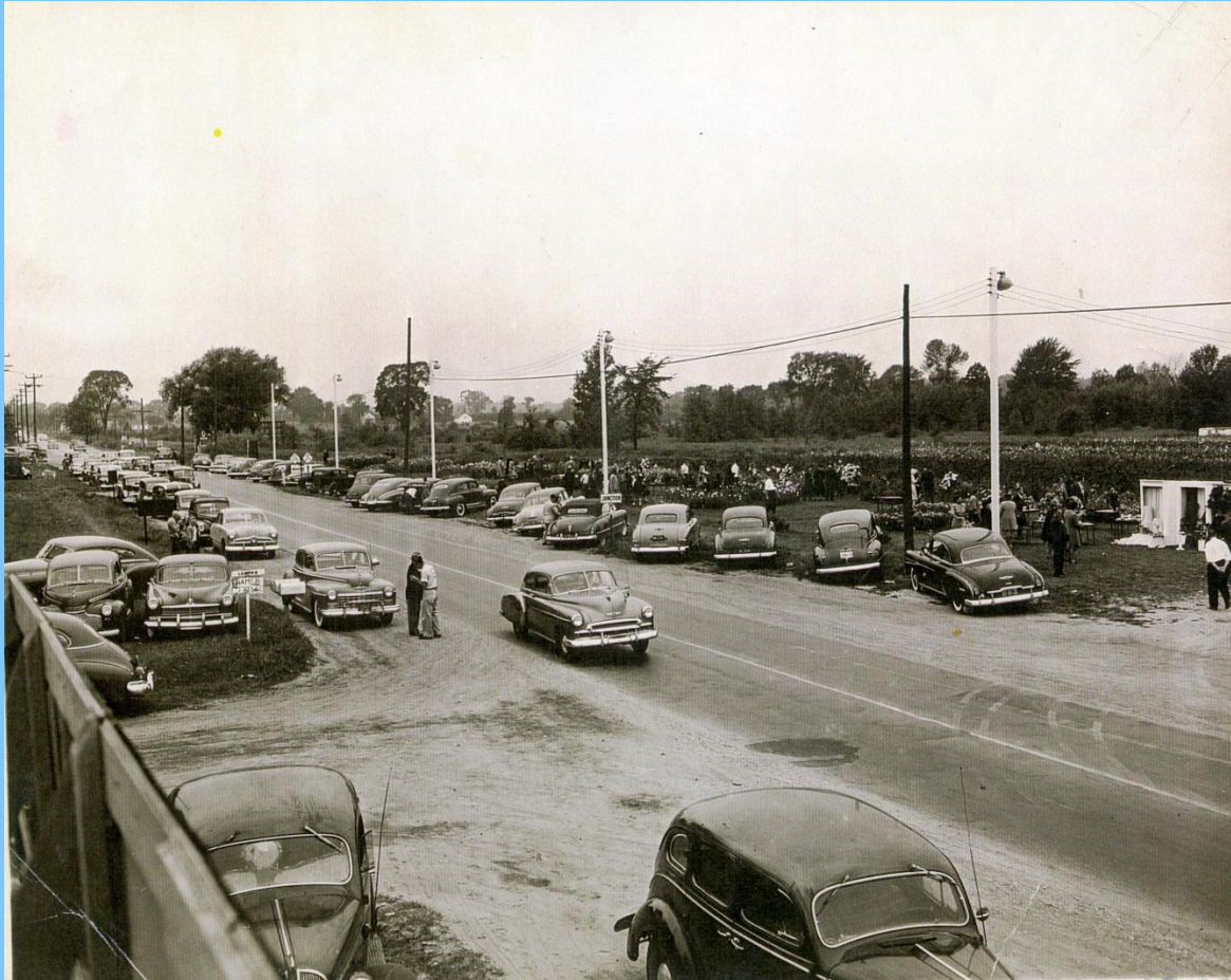
23 Mile Road near the Koenig dahlia farm

Those who do not remember the past are condemned to repeat it.