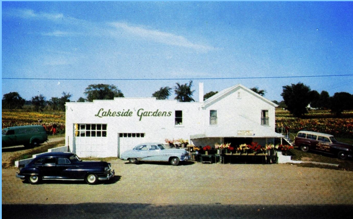
Lakeside Gardens in the 1950s