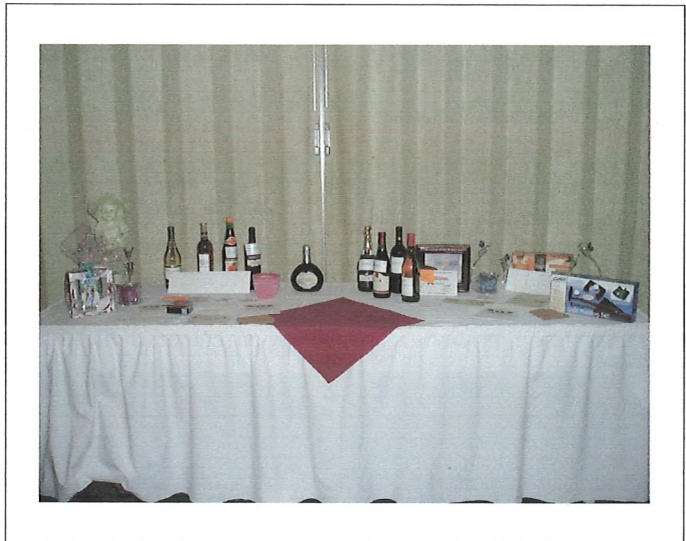
The Banquet prize table.

As usual, there was more than the great food and excellent ambience. We were fortunate to have many contributions for our raffles and door prizes. Success was also had with the 50/50 raffles. Also featured were historical displays and Deb