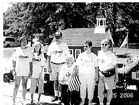
Historical Society members marched in the Bay-Rama parade Sunday, June 25th with the Weller schoolhouse model on the float. Nice t-shirts!.