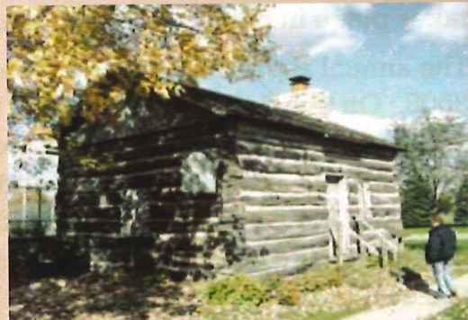
Crocker House (left) Baumgarten House (center) Richmond Area Historical & Genealogical Society "Donley Log Cabin"

The Fraser Historical Society will have their new depot welcome center open on Sunday, June 1 from 1 to 4 pm. This is located by the Baumgarten House at Masonic and Kelly.