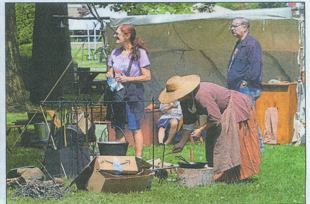
A reenactor demonstrates cooking methods of the past.