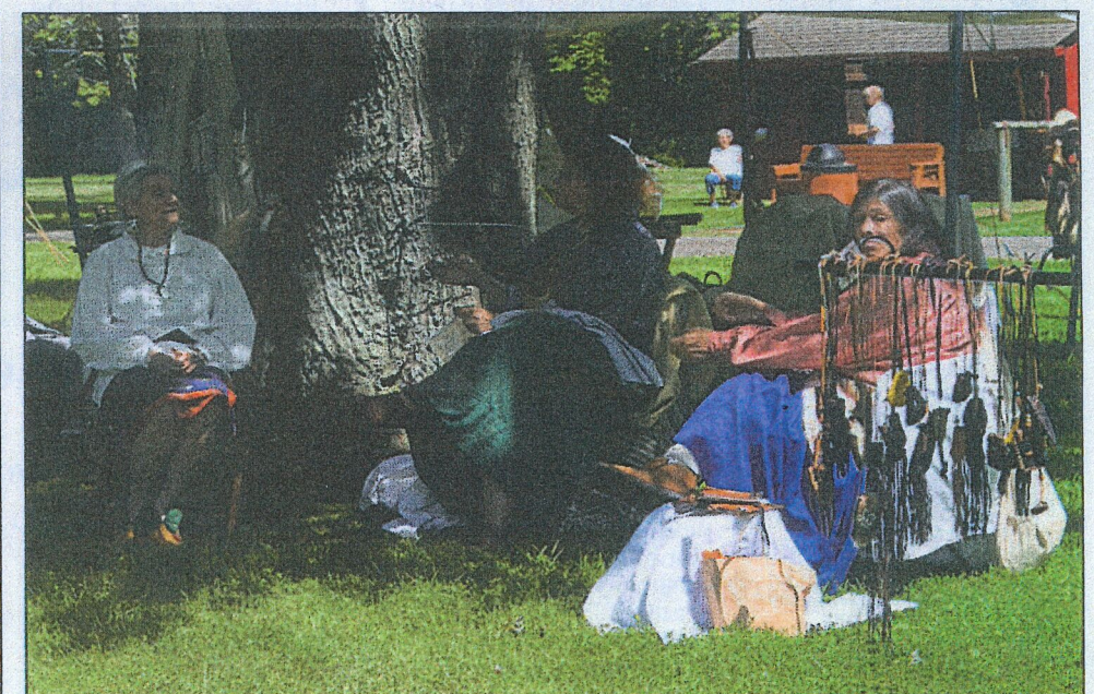
The Lac Ste. Claire Habitants et Voyageurs de Detroit were among the groups participating in the event.