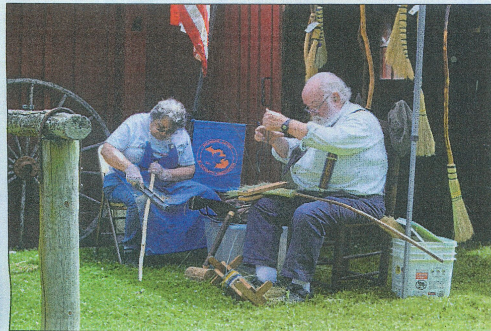
Broom making is demonstrated at the Chesterfield Township Historical Village.

The Chesterfield Township Historical Village is located at 47275 Sugarbush Road, adjacent to the Chesterfield Township Municipal Offices. For more information, call 586-949-0400 or visit chesterfieldhistoricalsociety.org .