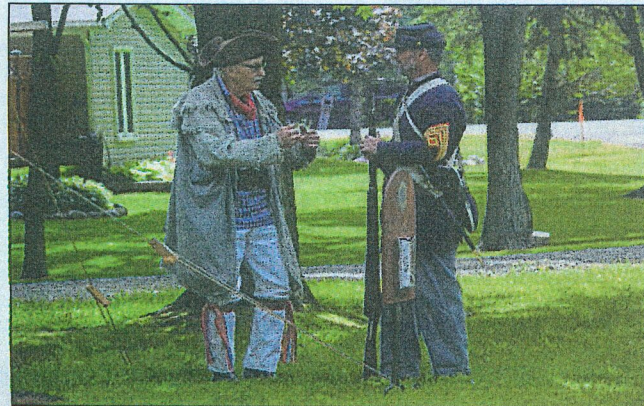
Reenactors of different eras stop to chat during a recent history event in Chesterfield Township.