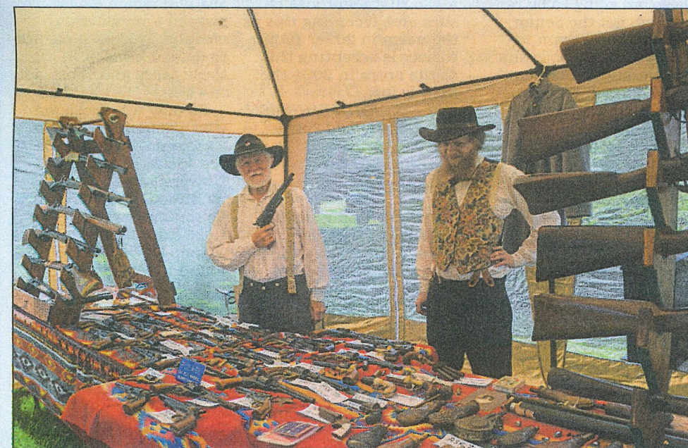
Civil War reenactors from the 7th Michigan Volunteer Infantry, Company B, displayed historic weapons and other items at a recent event in Chesterfield Township.