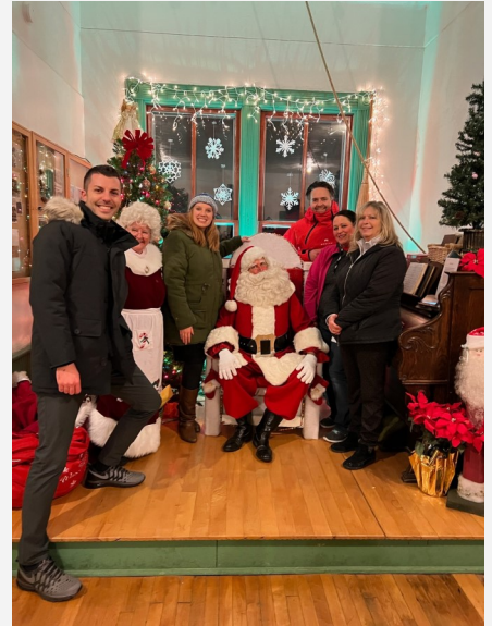
Santa and Mrs. Claus visited the Weller School on December 1.